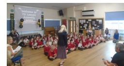
Leavers Awards Assembly