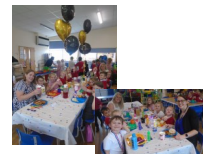
Always Good Table