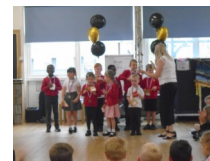
100% All year Attendance